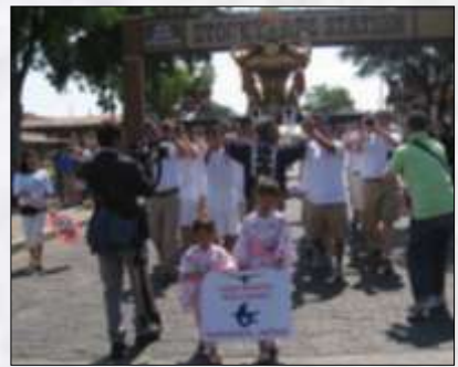
Mikoshi Parade in the Stockyards

The cities of Fort Worth and Nagaoka are always impressed by how our Society members and friends join in to help during these events. Thank you all for volunteering to assist our guests and participate in the Mikoshi parade!