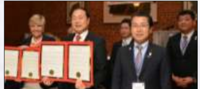
Mayors renew relationship