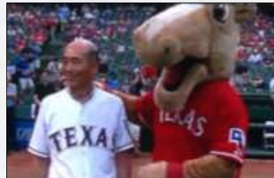
Ambassador with Rangers Mascot