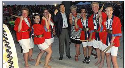
Taiko Drummers with the mayors