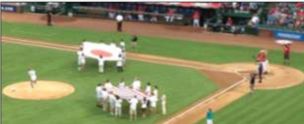
Japanese Ambassador Sasae throws in the first pitch